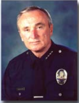
WILLIAM J. BRATTON CHIEF OF POLICE