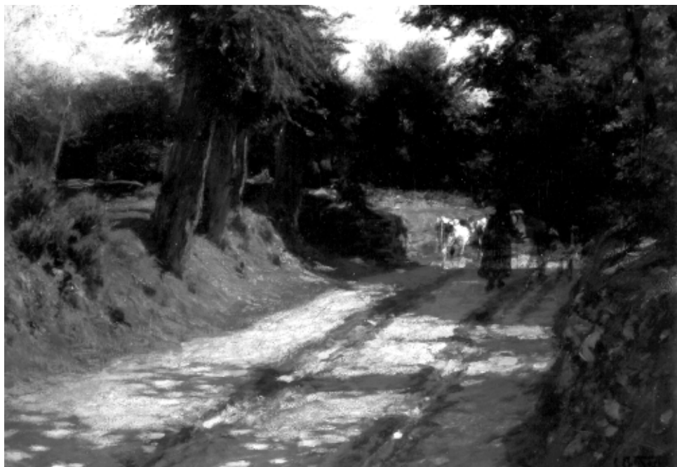
POTTHAST, Edward Landscape oil on canvas 15" x 22" signed lower left