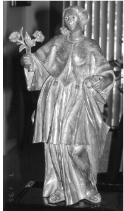
Bohemian gilded Madonna holding flowers circa 1435 limewood