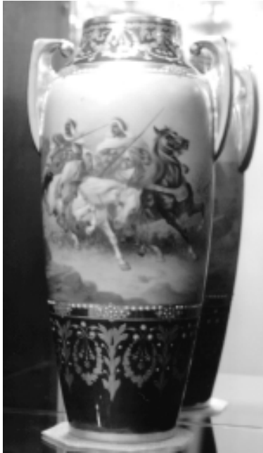
gilded porcelain vase Dresden 1860 painted figures of Arabs on horses