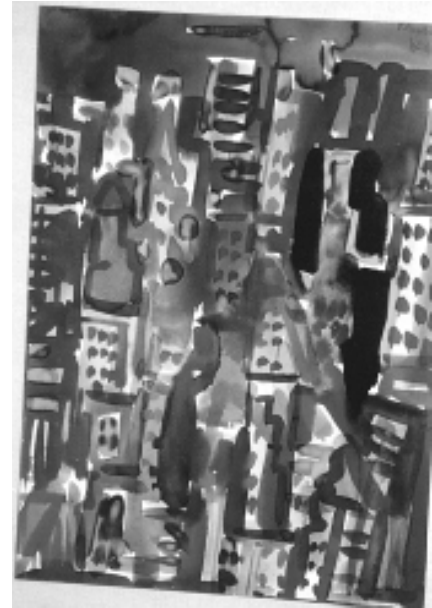
BEARDEN, Romare 1914-1988 Manhattan street scene watercolor in blue, green & yellow 24" x 18"