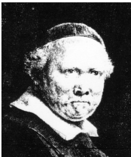
REMBRANDT, Harmensz van Rijn 1658 Lieven van Coppenol, Writing Master etching, drypoint & burin 5 5/8" x 5 1/4"