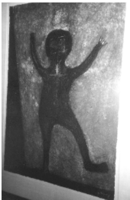
TAMAYO, Rufino 1974 Nino Bailando (Dancing Child) mixografia print 29" x 21"