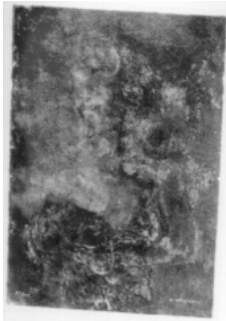
NISHIZAWA, Luis 1926- abstract of cave and figures mixografia print approx. 40" x 30"