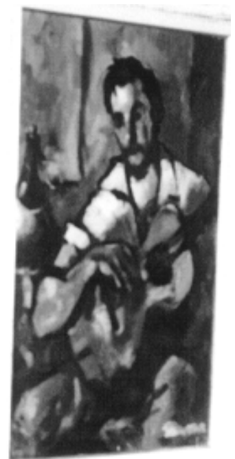
unknown guitar player oil on canvas approx. 36" x 24"