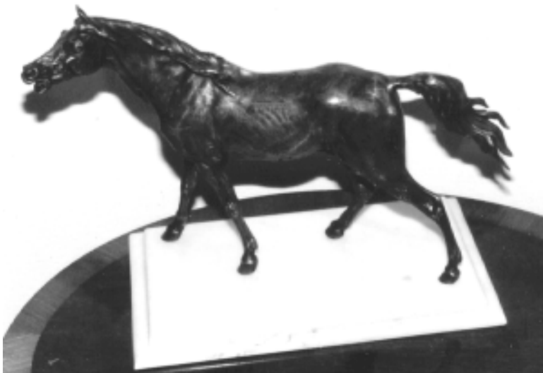
bronze sculpture of horse 19th century 11" x 17"