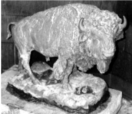
Shrady's Monarch of the Plains

When a West Los Angeles couple returned to their home in March of 1996, they discovered they were the victims of the theft of their Henry Merwin Shrady bronze sculpture of a buffalo entitled "Monarch of the Plains." The bronze had been in the family since the 1930s and had always been kept outdoors near the back door. Later, the family was amazed to learn that another statue from the same cast was auctioned at Christie's in New York for $123,500 in December of 1996.