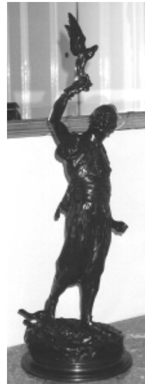
MENE, Pierre-Jules bronze sculpture 1873 26" tall depicting man with falcon