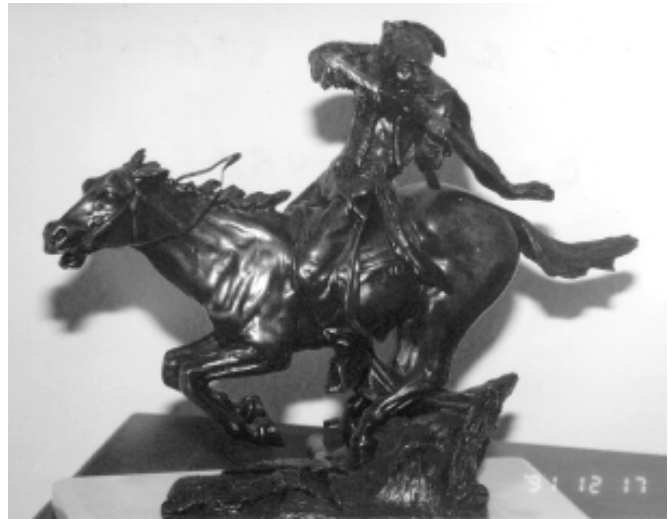
KAUBA, Carl bronze sculpture 19th century