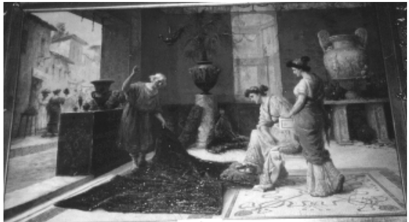
FORTI, Ettore 1840 oil on canvas 30" x 48"