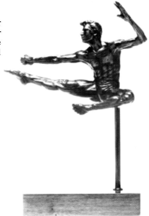
D'AMBROSI, Jasper The Dancer bronze with wood base about 15-18" tall