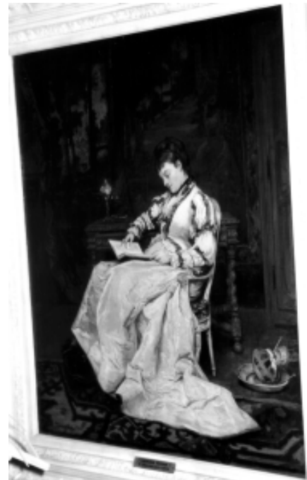
DAMERON, F. 1873 Leisure Hours oil on canvas 24" x 20" signed lower left